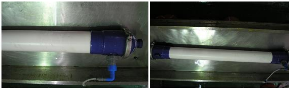
Figure 3: Membrane Module Leak Test

The use of this product in and of itself does not necessarily guarantee the removal of cysts and pathogens from water. Effective cyst and pathogen reduction is dependent on the complete system design and on the operation and maintenance of the system. No freedom from any patent owned NanoH2O Co., Ltd. or others is to be inferred. Because use conditions and applicable laws may differ from one location to another and may change with time. Customer is responsible for determining whether products and the information in this document are appropriate for