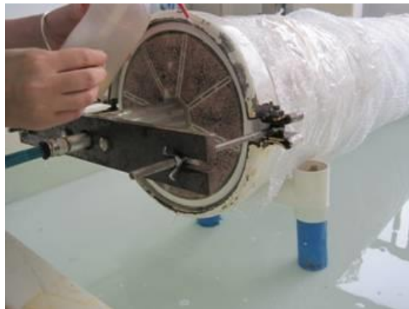
Figure 1: Integrity Test Kit for 10" Modules

Do not apply excess force. Excess force may damage the module. The fixing bar is only intended to prevent movement of the air supply adaptor